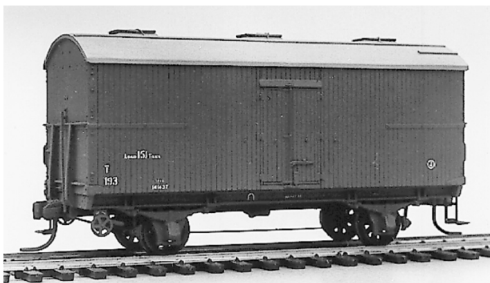
Model illustrated has been fitted with shunter's steps, handbrake and couplers (not included).

The wagons represented by this kit were numbered in the range 192-343 and 392-417. Wagons with end bunkers and only two roof hatches were numbered 343-392. The April 1995 issue of the Australian Model Railway Magazine features an article on the V.R. T vans which provides further information on their history.